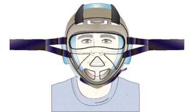
Universal Face Shield with Headgear